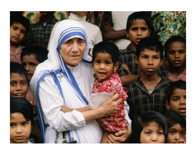
-Mother Teresa of Calcutta-

The fifth and final part of this series will describe the ceremony of canonization and some other conclusions.