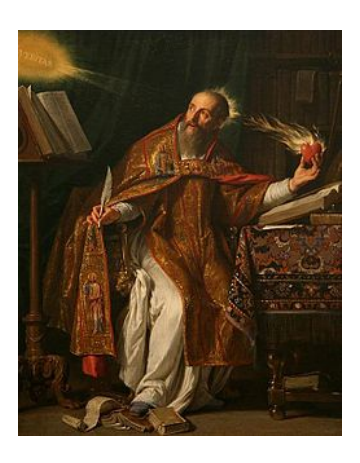
-Saint Augustine of Hippo-

The fourth part of this series will bring to our attention the importance of miracles in the process of canonization.