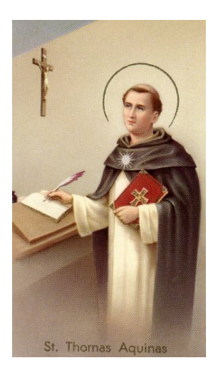
-Saint Thomas Aquinas-

Part III will detail the stages of the process of canonization.